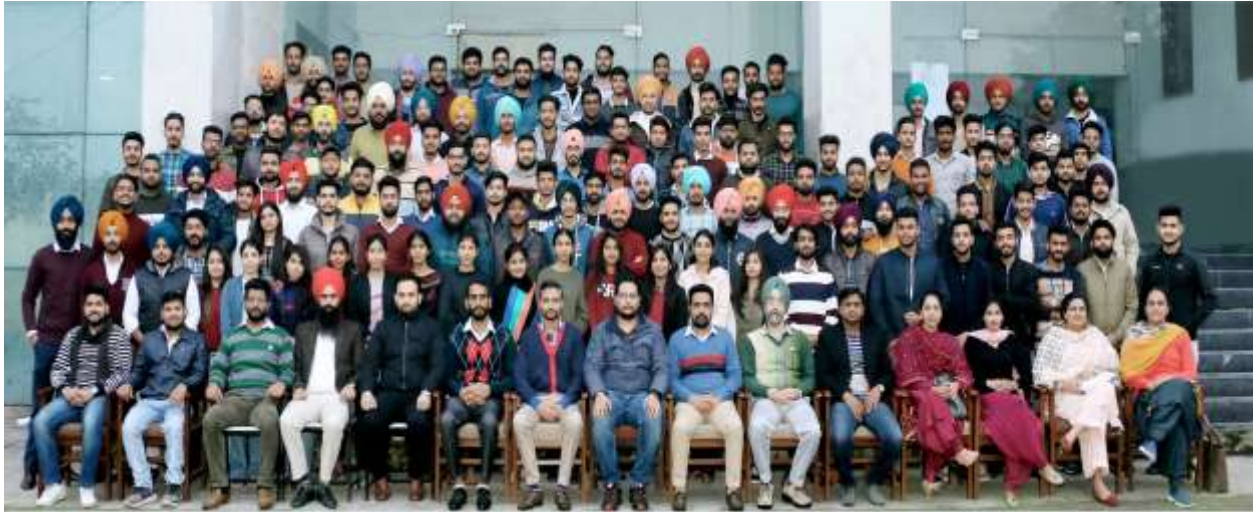
Department of Civil Engineering