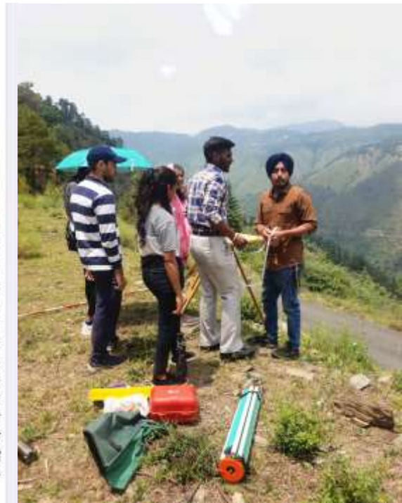
Survey Camp (Civil)