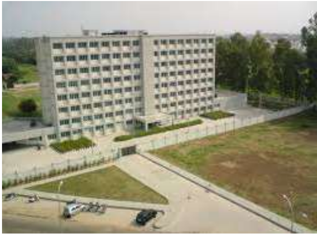
Mai Bhago Hostel (Girls)