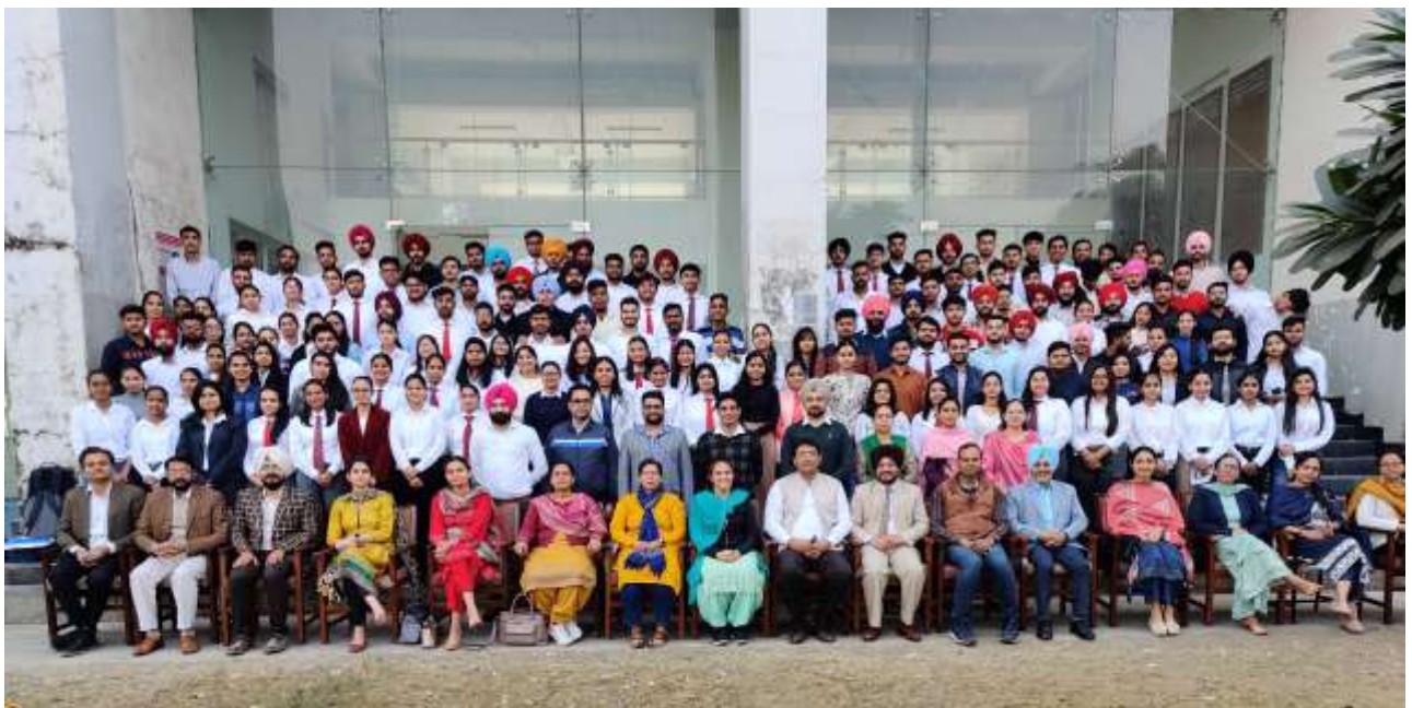
Department of Computer Science & Engineering