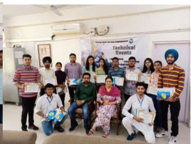
Technical Events (Cube making and quiz competition)