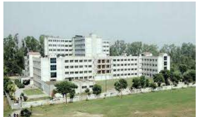
Baba Banda Singh Bahadur Hostel (BOYS)