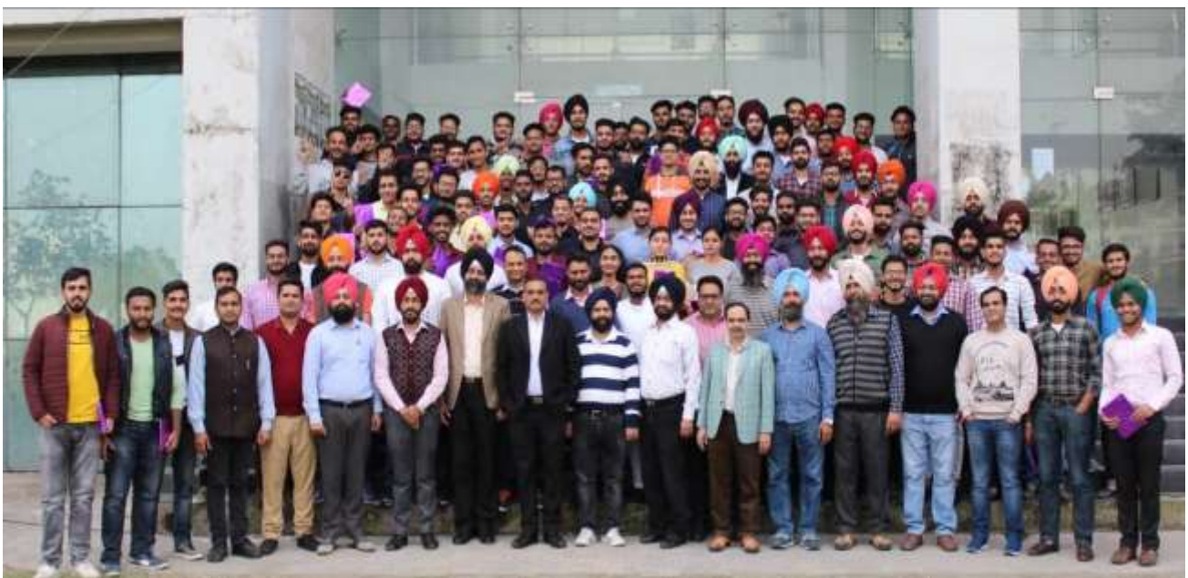
Department of Mechanical Engineering